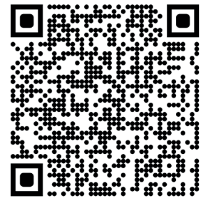
How to give capsules