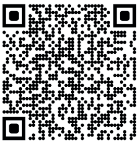
How to give ear medicines