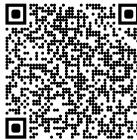
How to give granules and powders