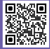
Medicines for Children home page

Medicines for Children provides practical and reliable information about more than 220 medicines used for children and young people. The information addresses frequently asked questions, such as how and when to give the medicine, what to do if you forget to give the medicine, and any possible side-effects. The website hosts many other useful resources and regular news stories.