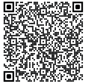
How to give liquid medicines