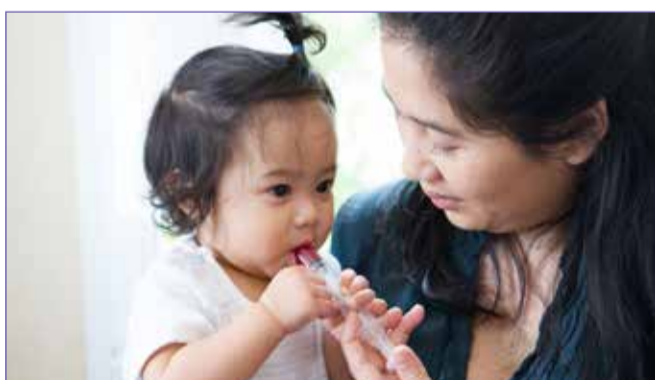
Information leaflets and videos on how to give medicines

medicinesforchildren.org.uk hosts over 220 children's medicines information leaflets and 'how to' videos. Check to see if there is leaflet on your child's medicine.